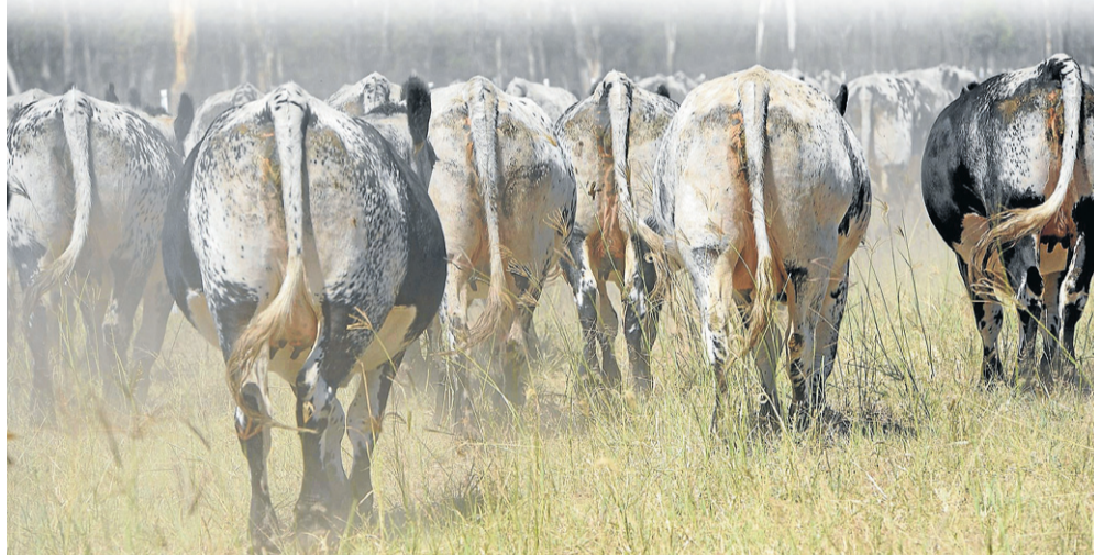
Speckled park cross Angus heifers at "Glenrowan", Boggabri, that are sisters to the steers in the feedback trial.

"I think these feedback trials are the best benchmark for cattle – not entering them to try to get places, I think they are just a fantastic tool and see how you are performing against other breeds and other producers."