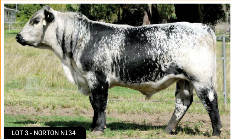
LOT 3 - NORTON N134