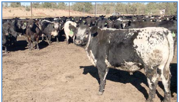
Minnamurra Steers in Mort & Co's Pinegrove Feedlot, Qld.