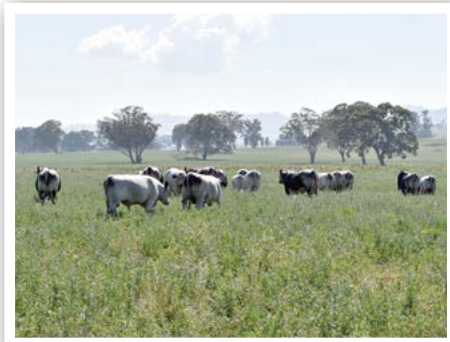
Bulls grazing in January 2018

Like all cattle breeders across this country, we have faced drought conditions over the last twelve months which have been tough. But we have managed through well enough, and one positive outcome is that it has proved to us what good-doers these Speckle Park cattle are. They are proving themselves good foragers, and in spite of the harsh conditions, the cows are still carrying condition and raising their calves. It's as though the drought has brought the characteristics of the breed to the fore and has added to our conviction that Speckles have a real place in the Australian herd, which will only continue to grow into the future.