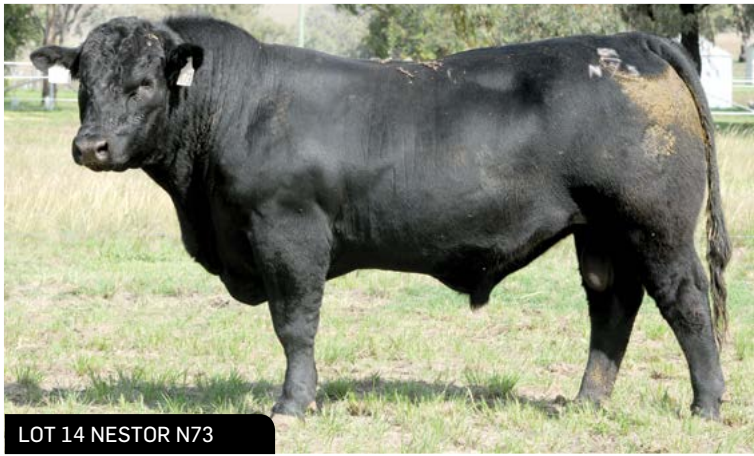
LOT 14 NESTOR N73