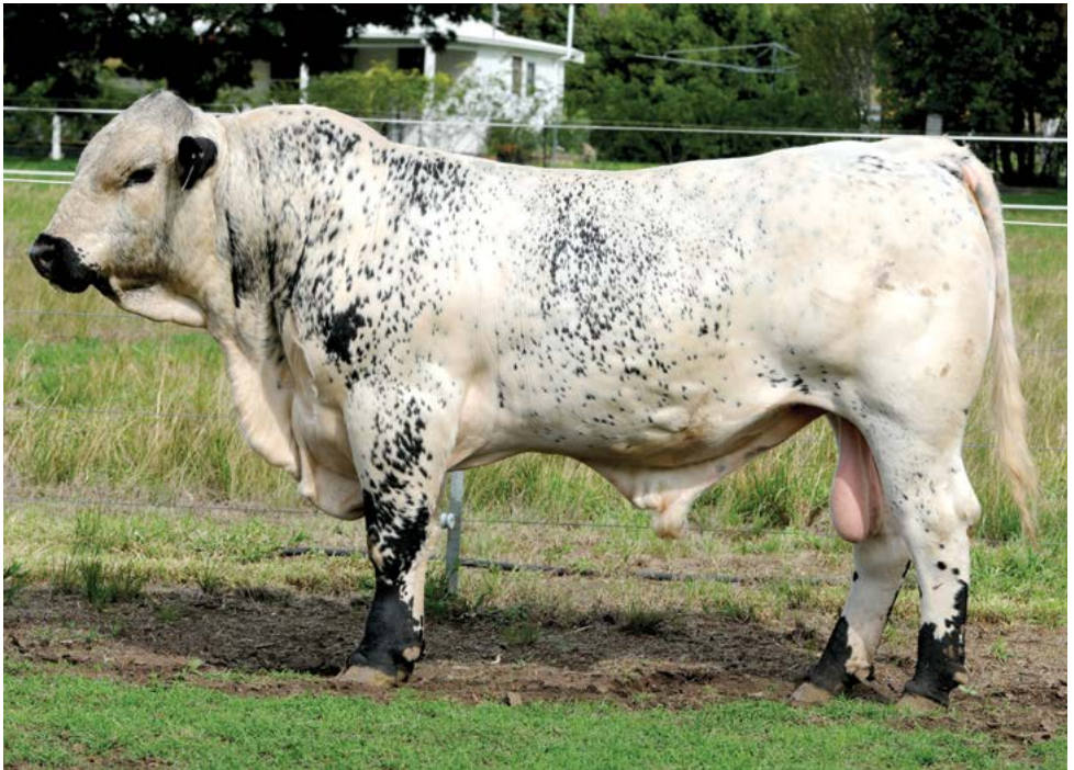
Lot 47 - MPC N198

The first cross bulls in lots 41 to 47 of this catalogue are all out of Minnamurra's best commercial Angus/Brangus females, joined to Royal Flesh 101Y, a great meat producing sire, and represent a similar type of animal to the tropical bulls we will be producing in the future.