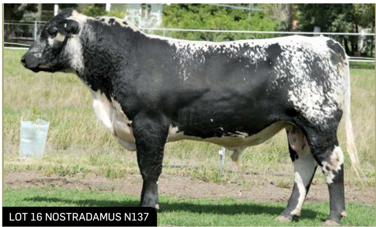
LOT 16 NOSTRADAMUS N137