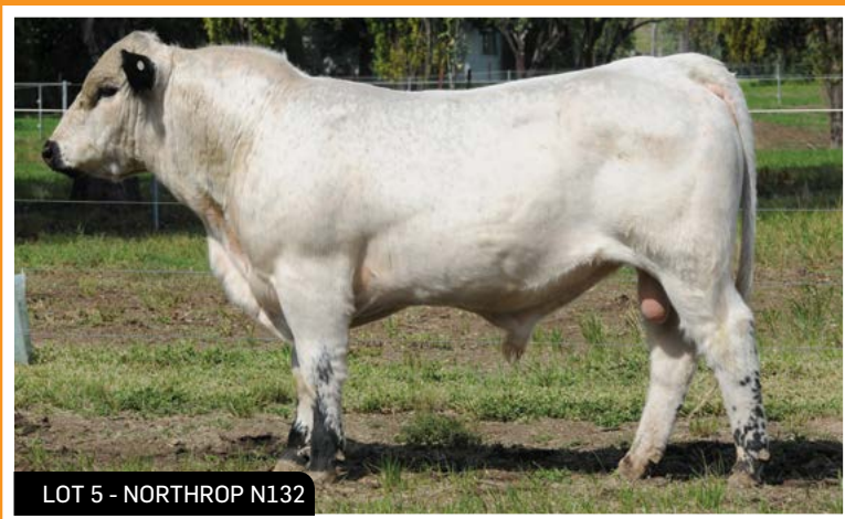
LOT 5 - NORTHROP N132