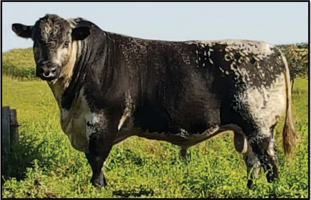
REDNECK JSF WHISKEY 4B