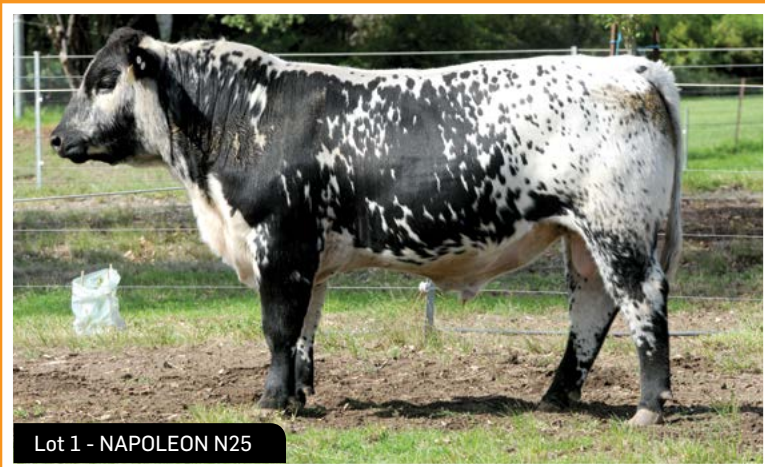
Lot 1 - NAPOLEON N25