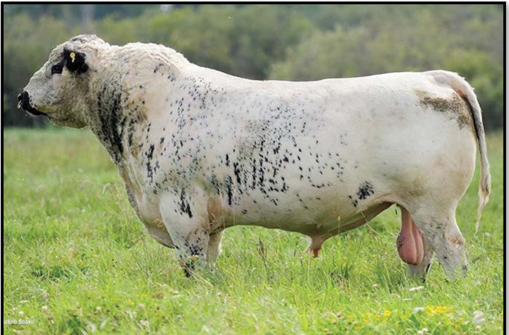
CODIAK SO LONG GEORGE 6Z