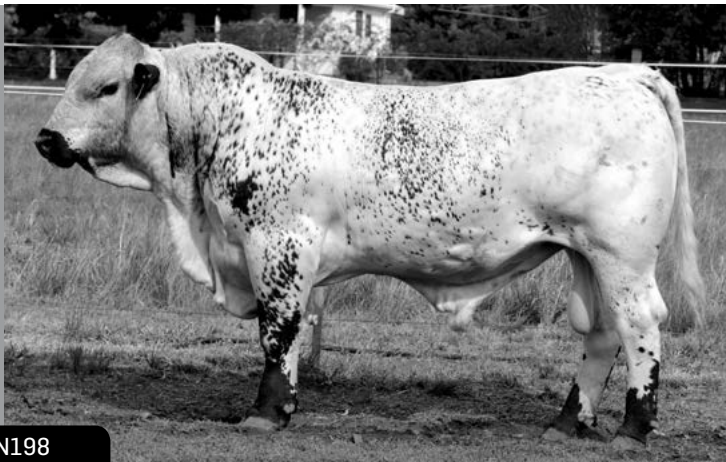
Lot 47 - N198