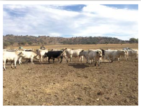
Same paddock, February 2019

Our philosophy is that to breed good bulls, we have to focus on breeding good females, and the males will follow. Now that we are producing contemporary groups in sufficiently large numbers, we can begin to concentrate on the confirmation and fertility of our female lines, traits that are important in commercial herds. We have introduced two new sires into our AI program this year – River Hill 50T Crusader 025C, the top priced Speckle bull worldwide, and Double S JSF Rawhide 260D, another exciting young sire, which we think will be well suited to the commercial breeding requirements of this country.