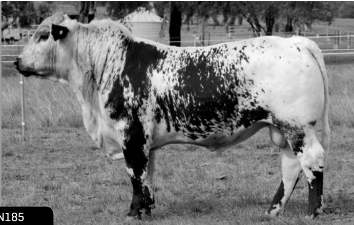
Lot 44 - N185