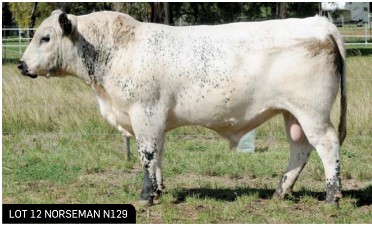
LOT 12 NORSEMAN N129