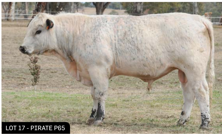
LOT 17 - PIRATE P65