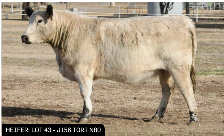
HEIFER: LOT 43 - J156 TORI N80