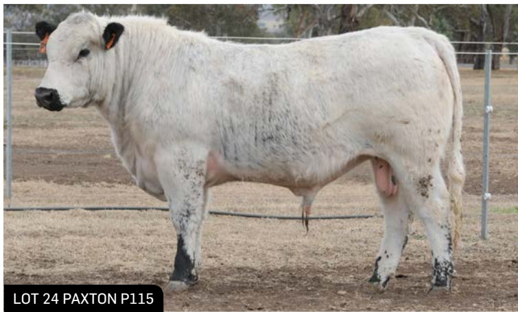
LOT 24 PAXTON P115