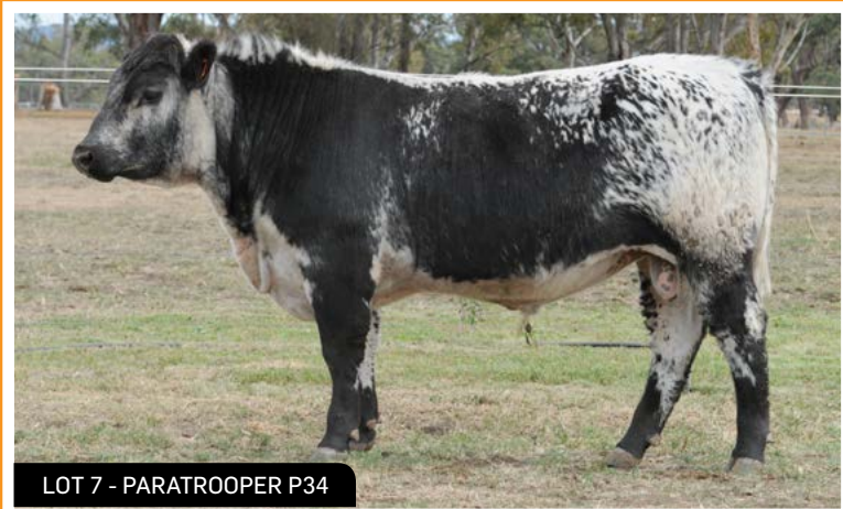
LOT 7 - PARATROOPER P34