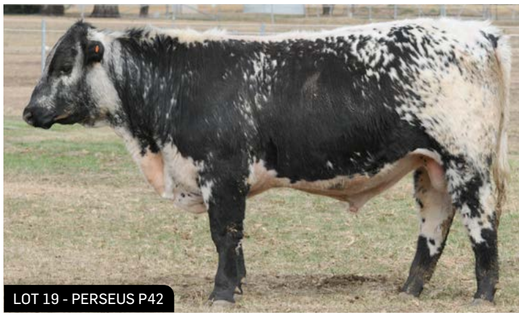
LOT 19 - PERSEUS P42