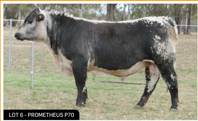
LOT 6 - PROMETHEUS P70