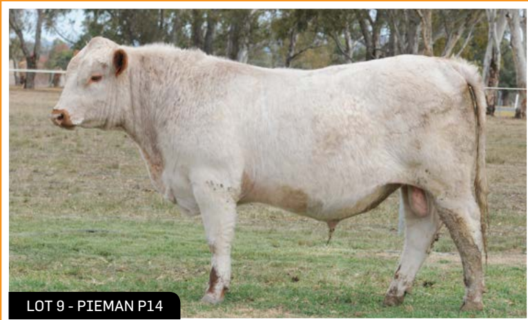
LOT 9 - PIEMAN P14