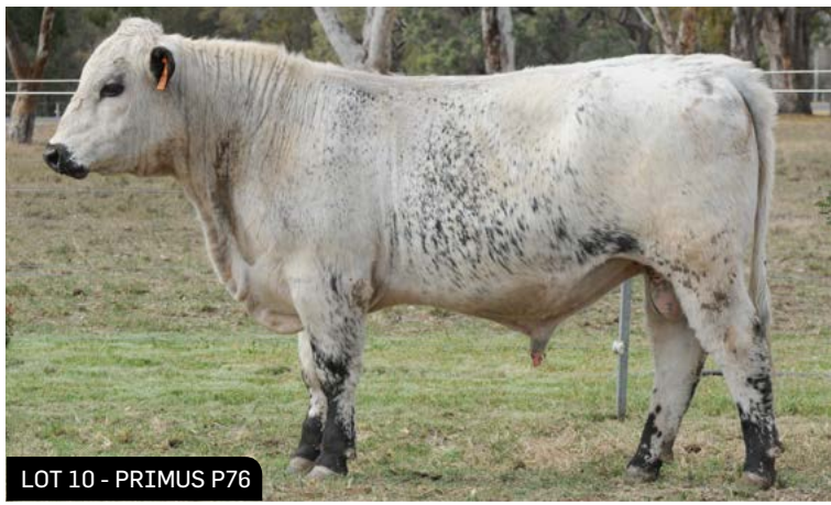
LOT 10 - PRIMUS P76