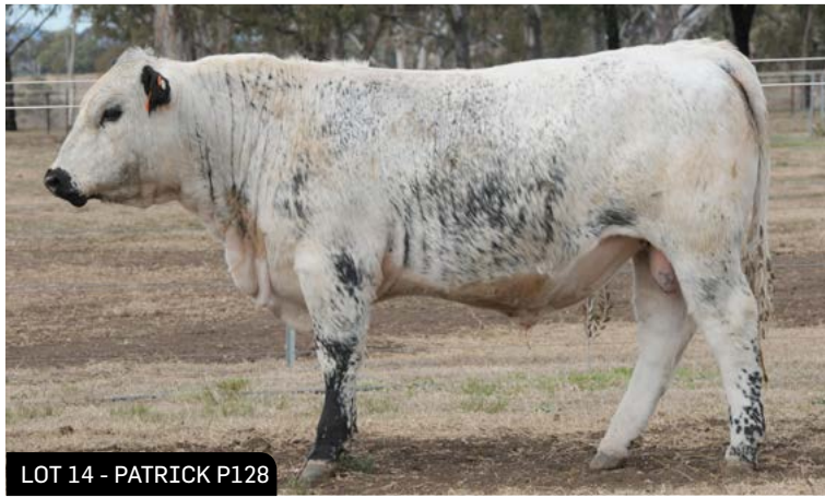
LOT 14 - PATRICK P128