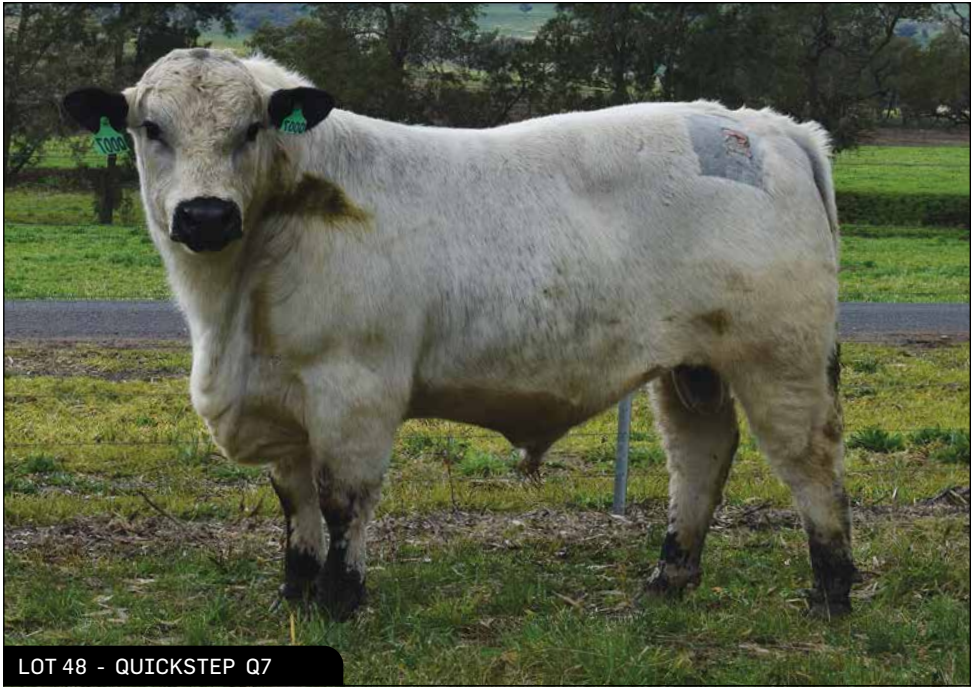
LOT 48 - QUICKSTEP Q7