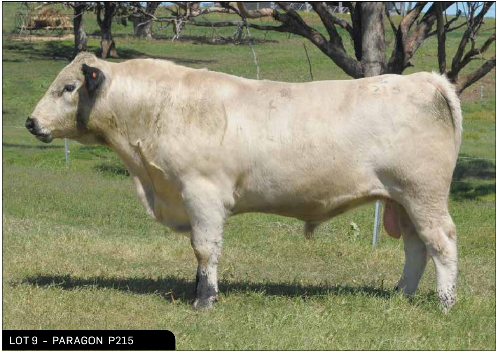
LOT 9 - PARAGON P215