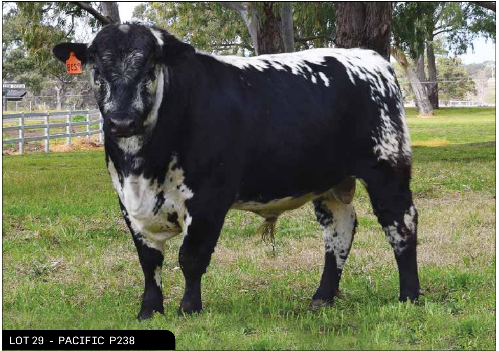
LOT 29 - PACIFIC P238