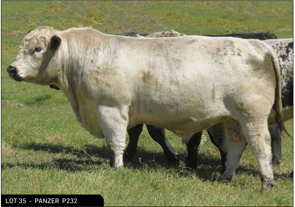
LOT 35 - PANZER P232