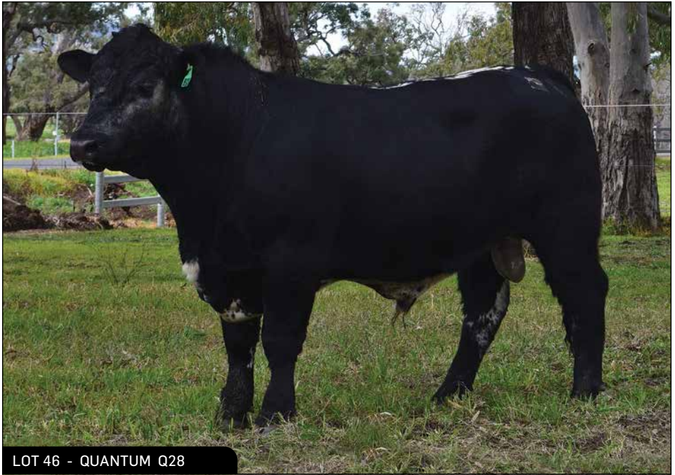
LOT 46 - QUANTUM Q28