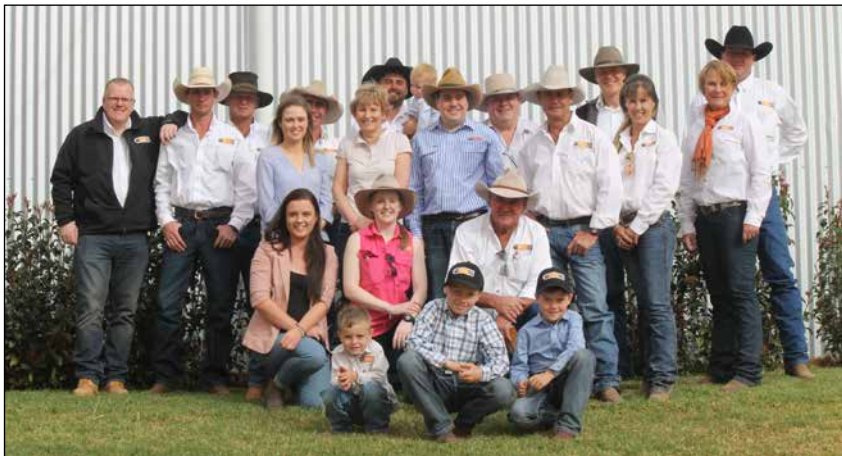
Minnamurra Staff at last year's Spring Sale.

Thank you for your support, stay safe, and I wish you well with your bidding.