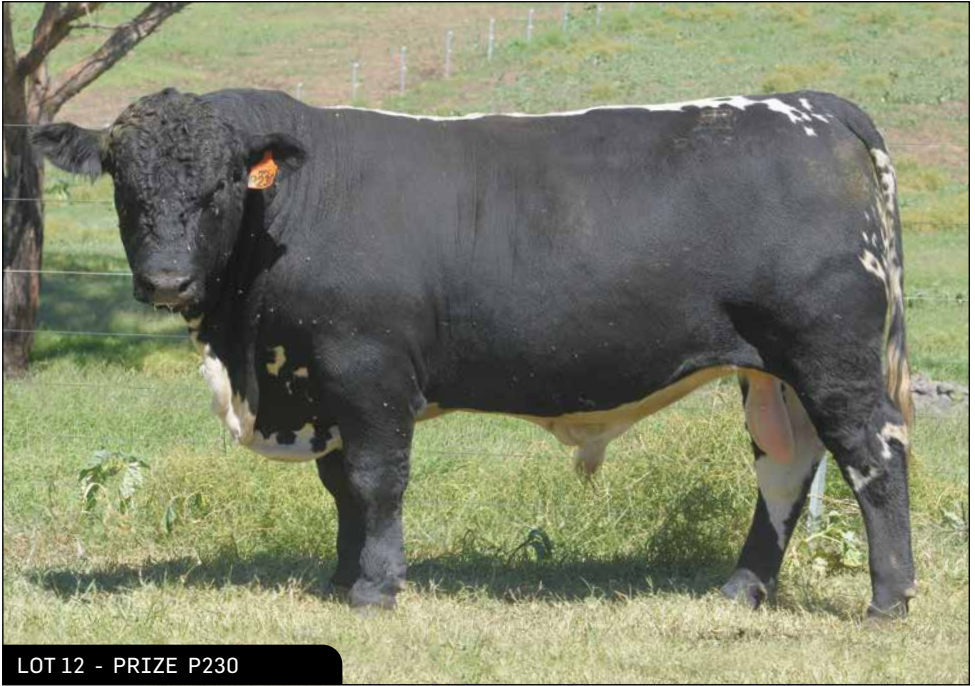
LOT 12 - PRIZE P230