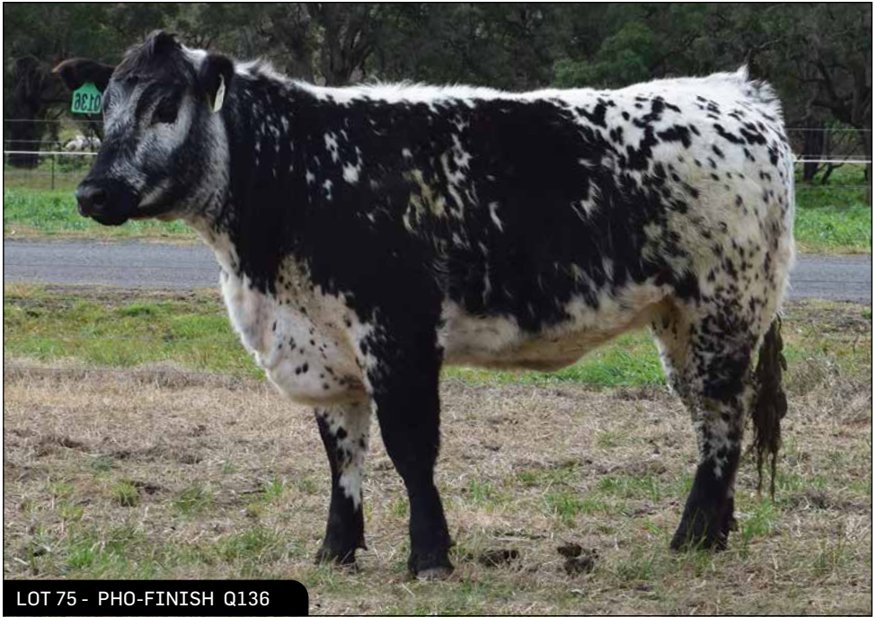
LOT 75 - PHO-FINISH Q136