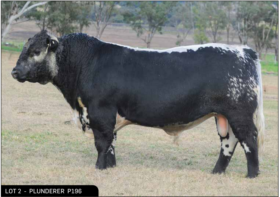
LOT 2 - PLUNDERER P196