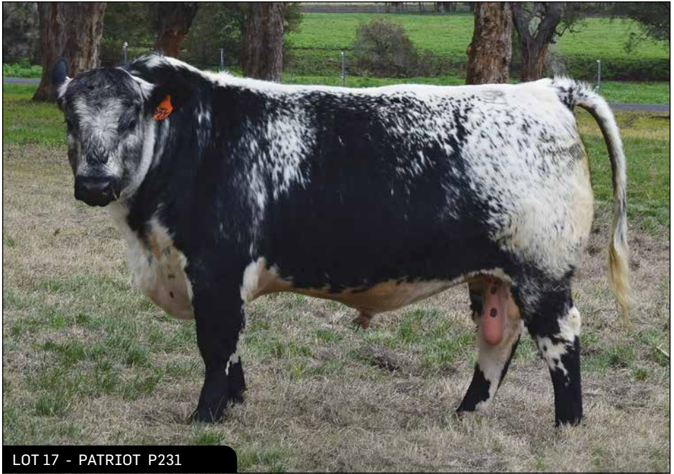
LOT 17 - PATRIOT P231