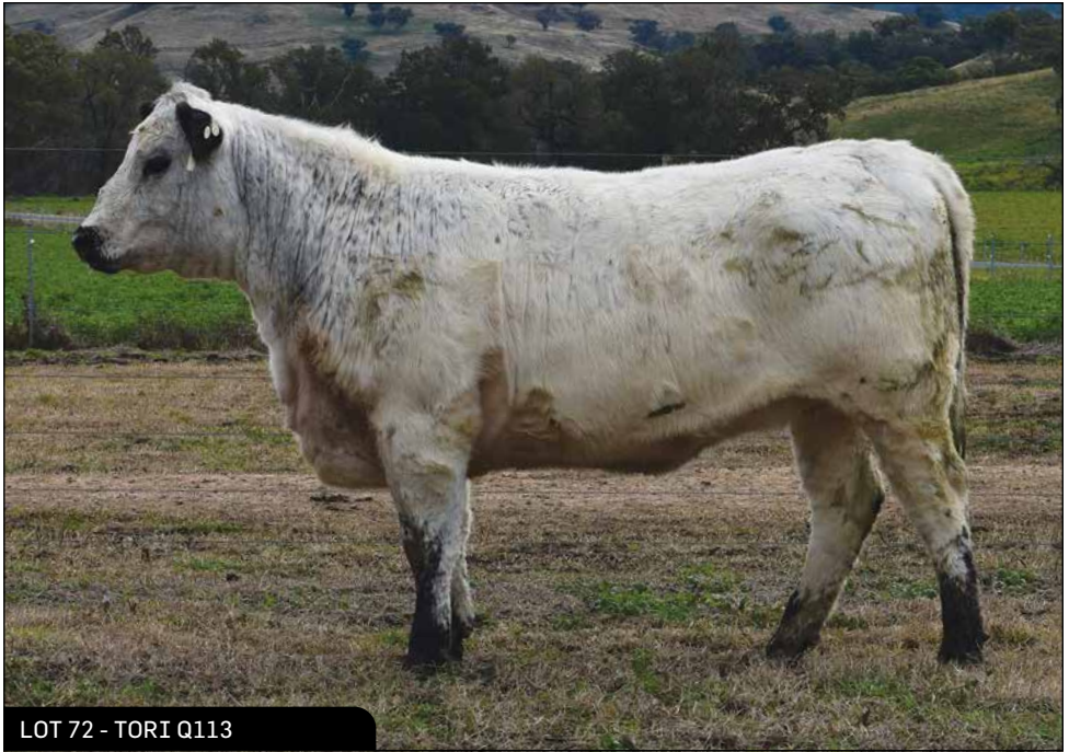
LOT 72 - TORI Q113