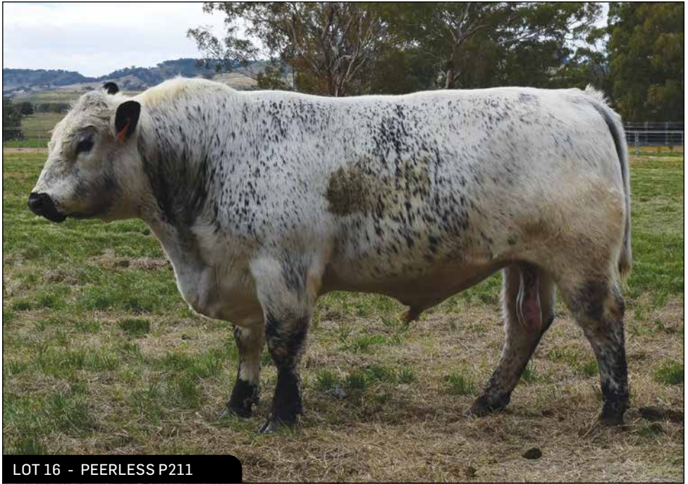
LOT 16 - PEERLESS P211